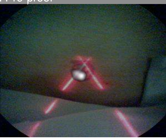
Figure 4a and 4b

The exact position of the seed was confirmed with a portable gamma camera fitted with adequate iodine-125 photopeak energy.